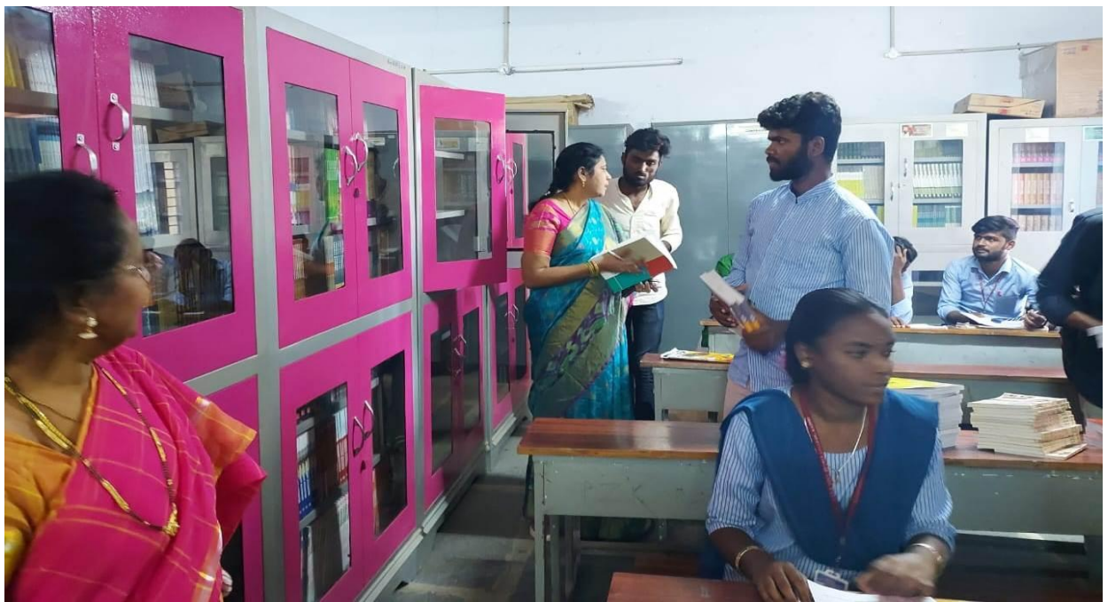
Principal Madam and the Library in-charge lecturer interacting with the students in the College Library