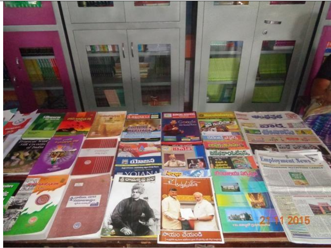
Celebrated National Library Week (Books Exhibition in the Library)